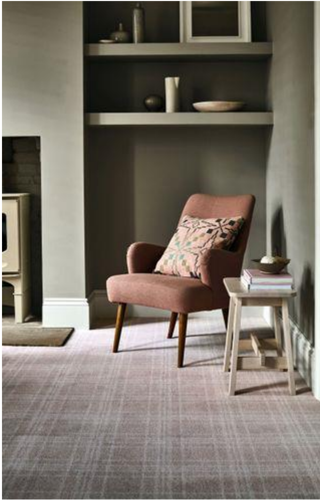
Choosing a runner for your stairs