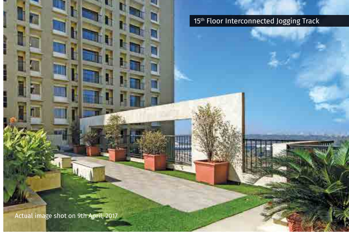
15 th Floor Interconnected Jogging Track