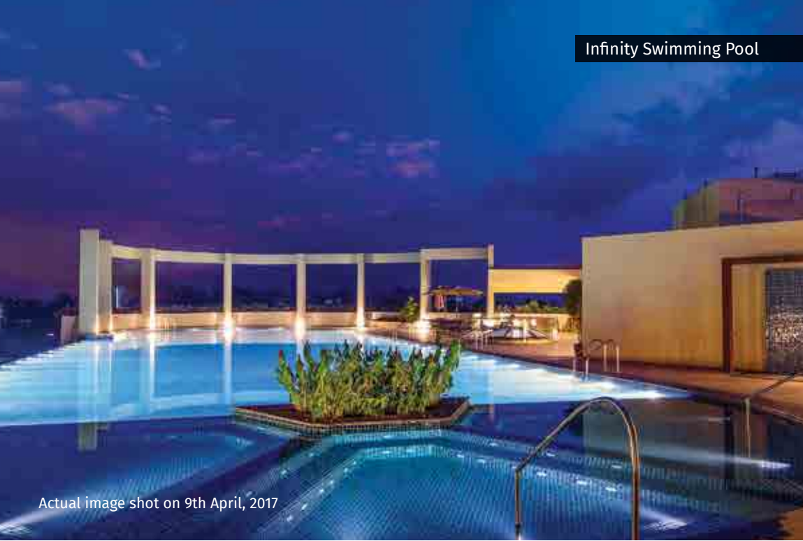
Infinity Swimming Pool