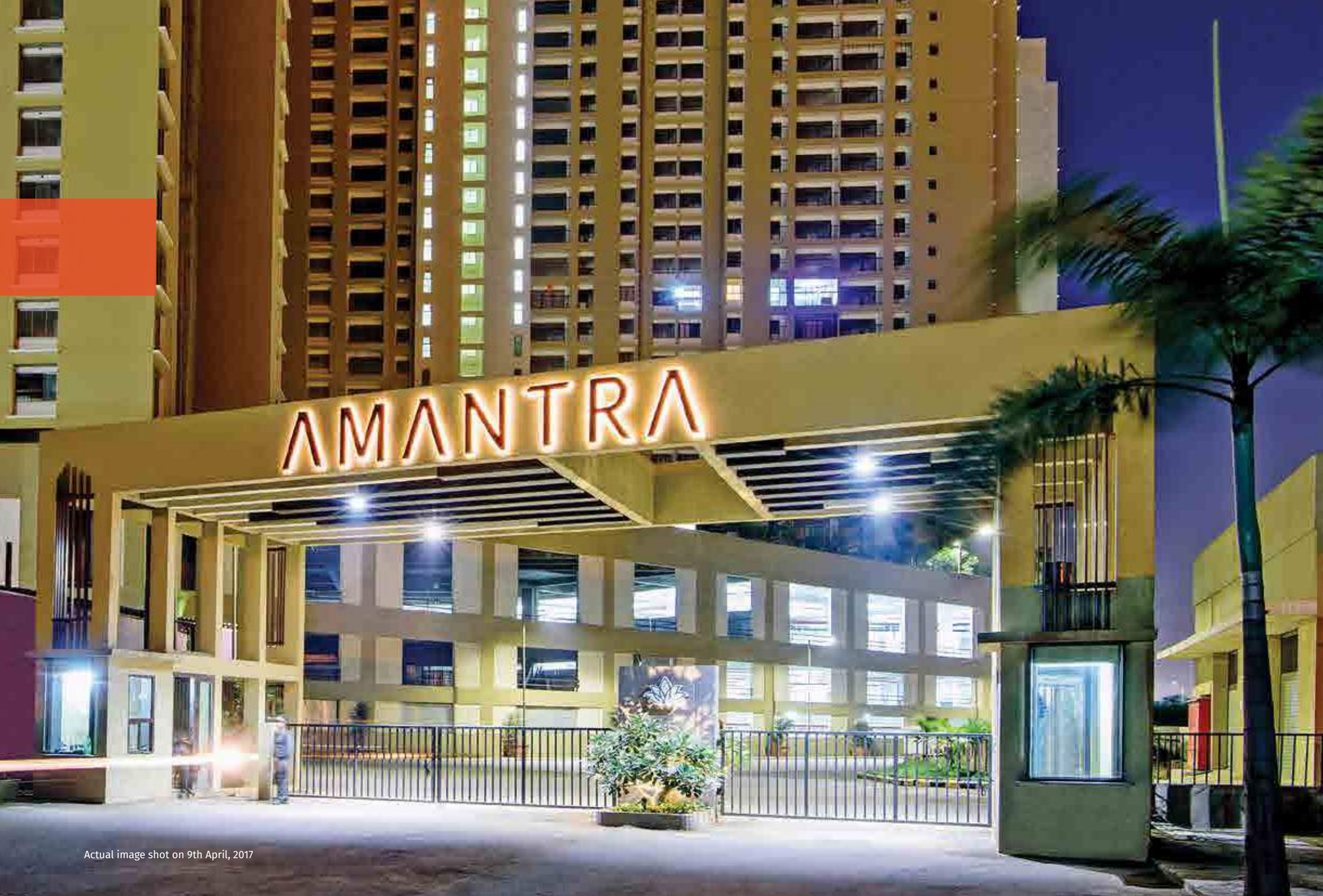
Actual image shot on 9th April, 2017