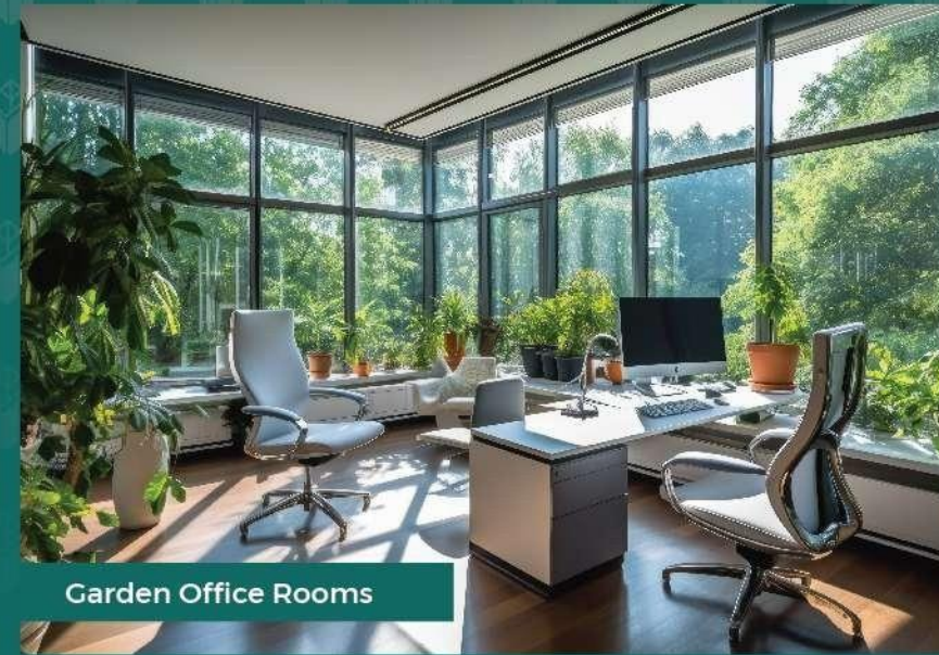
Garden Office Rooms