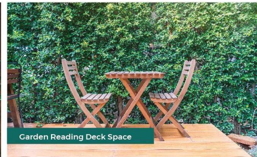
Garden Reading Deck Space