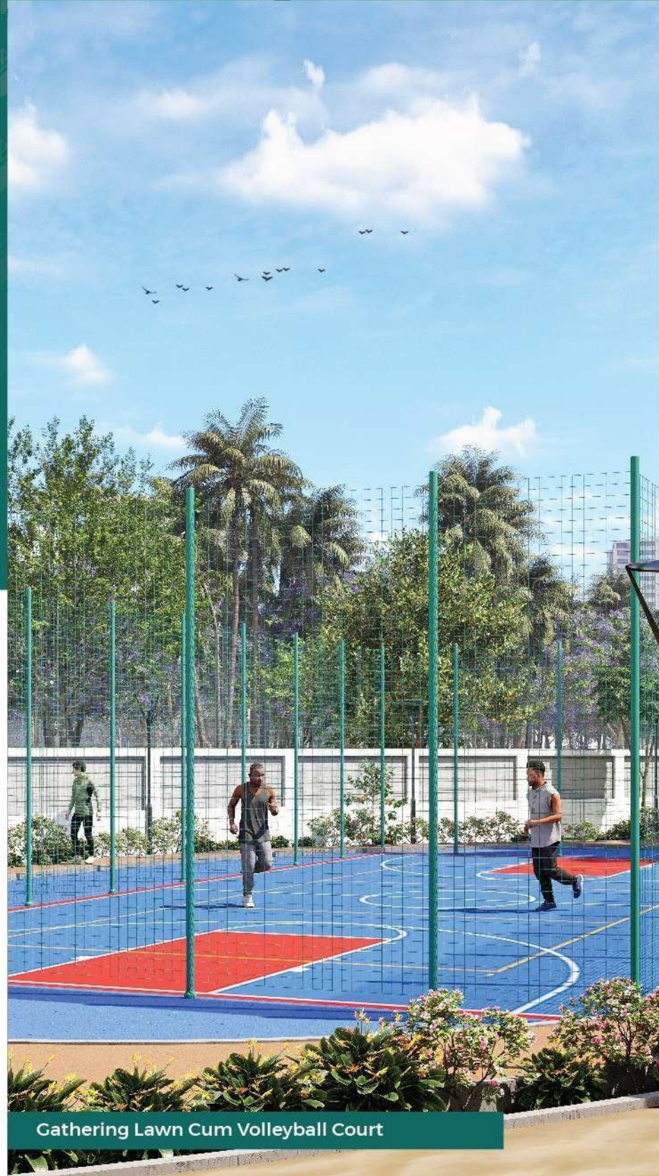
Gathering Lawn Cum Volleyball Court