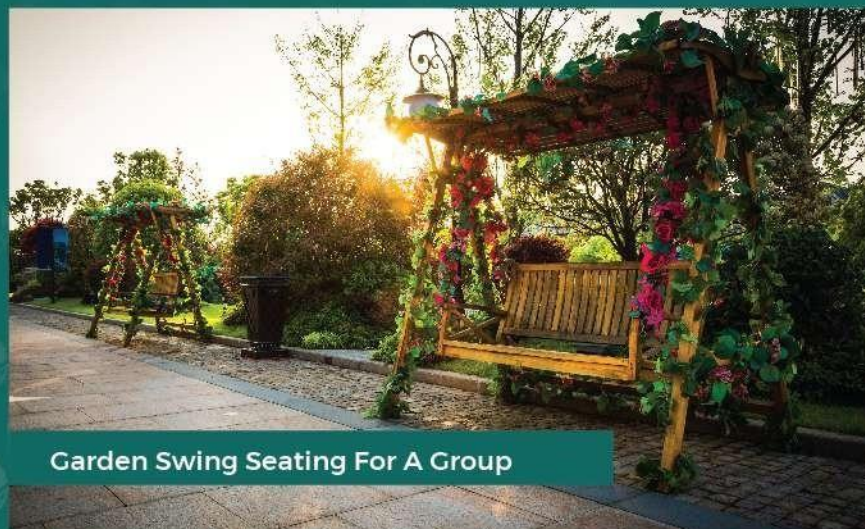
Garden Swing Seating For A Group