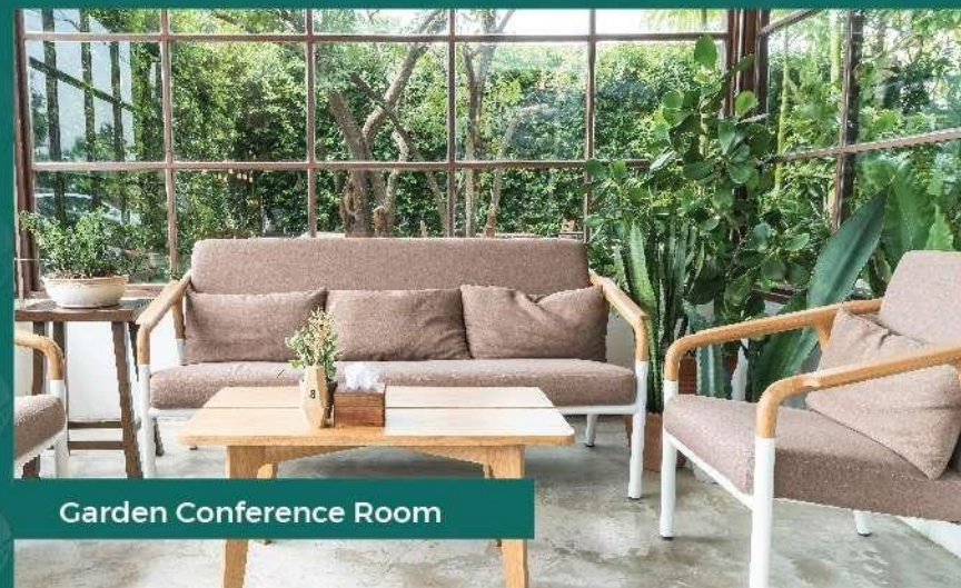
Garden Conference Room