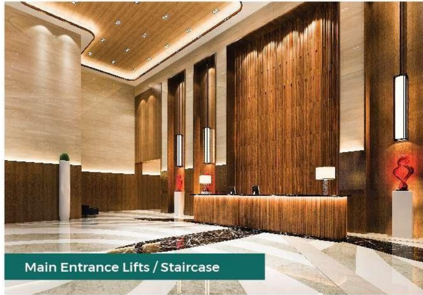
Main Entrance Lifts / Staircase