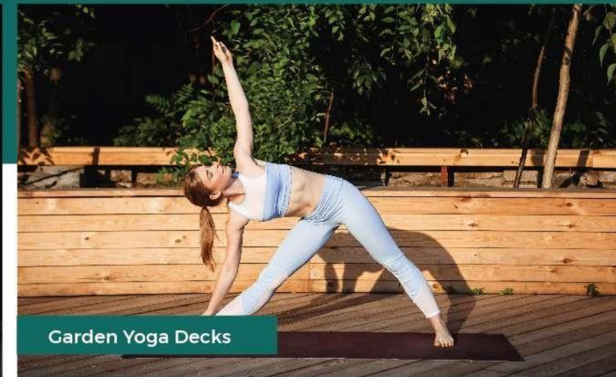
Garden Yoga Decks