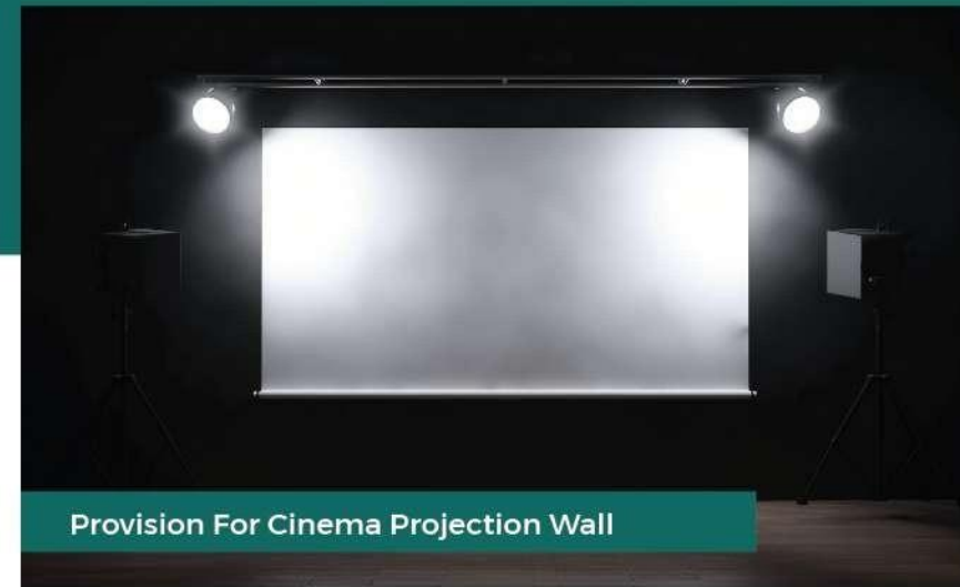
Provision For Cinema Projection Wall