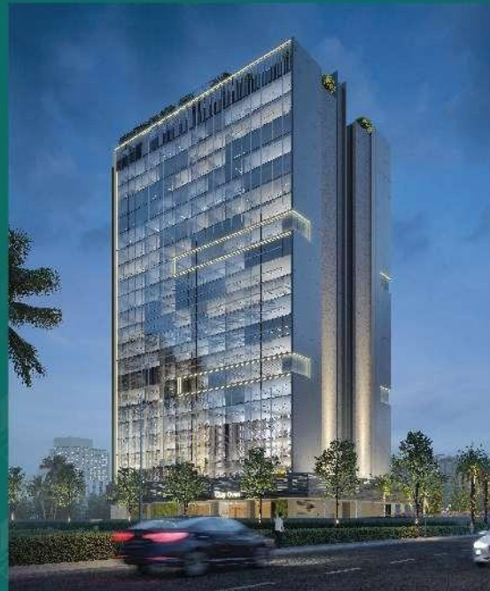
9 Business Bay