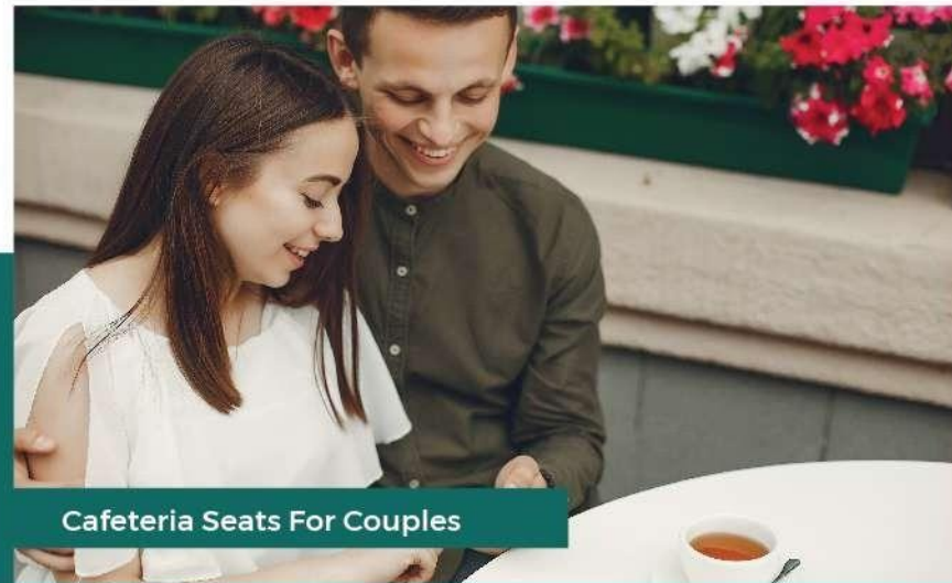
Cafeteria Seats For Couples