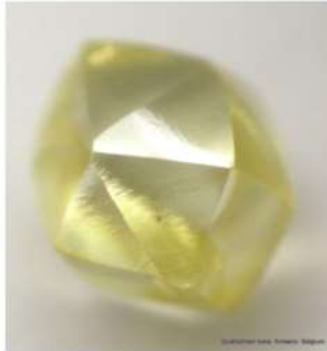
raw yellow diamond

As cited before, Venus is known to bring fame and wealth which is why numerous people seeking economic stability wear diamonds. Indian astrology states that wearing diamond rings can carry financial triumph by increasing one's career growth.