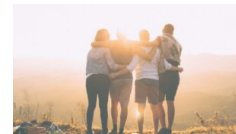
Top 20 Fun Things to Do with Friends