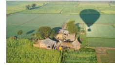
All You Need To Know About The Hot Air Balloon Experience