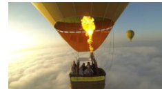
Flying in a Hot Air Balloon – Once in a Lifetime Experience