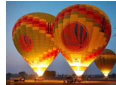
Amazing Things To Do On A Hot Air Balloon Ride