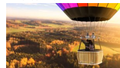
Propose Your Loved One In A Hot Air Balloon