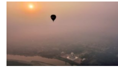
A Guide On Booking Hot Air Ballooning Experience In India