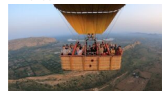
Best Time to Take A Hot Air Balloon Ride