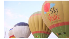
Best Things to Do While Travelling with Friends