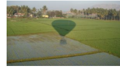
Go With The Flow in Marvelous Hot Air Balloon