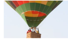
Activities You Shouldn't Skip In Your Next Jaipur Vacation