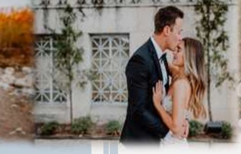
Austin wedding photographer